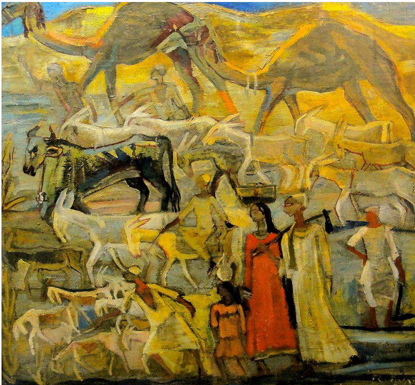
Figure 8: Ragheb Ayad, Caravan .