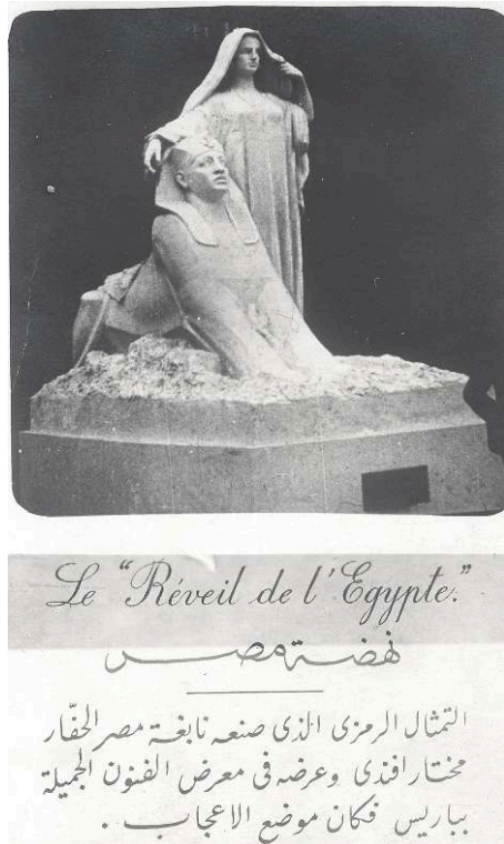
Figure 5: Model for Mahmoud Moukhtar's monument of Egypt's Awakening executed in Paris c. 1920.