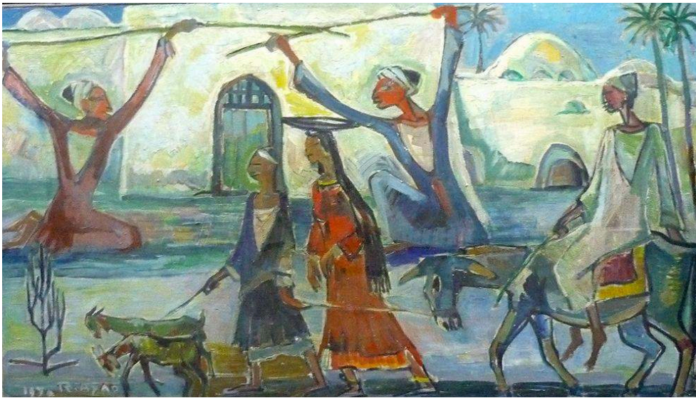
Figure 10: Ragheb Ayad, Work and Pleasure .