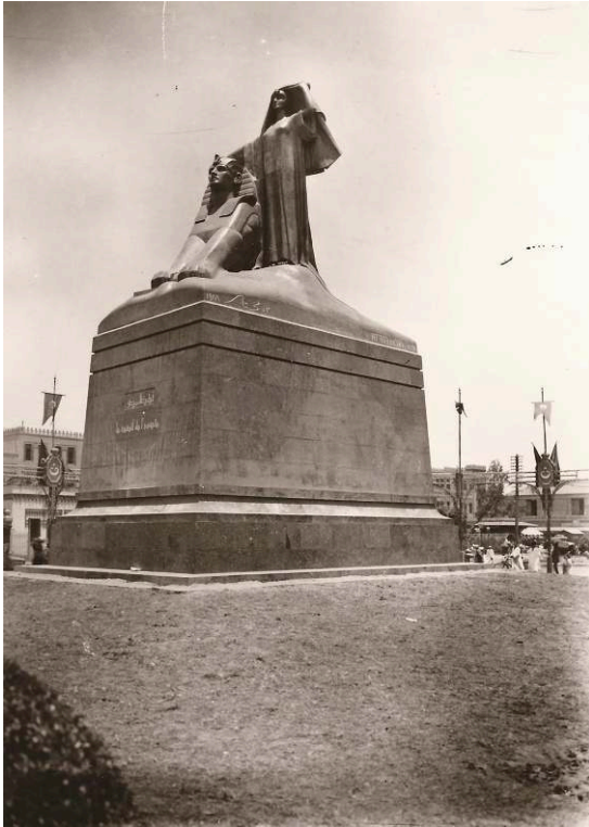
Figure 4: Le Réveil de l'Égypte on Bab al-Hadid Square in front of Cairo Central Railway Station, Lehnert & Landrock, c. 1929.