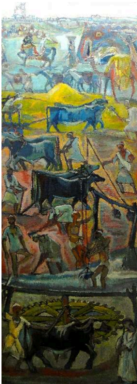
Figure 7: Ragheb Ayad, Work in the fields .