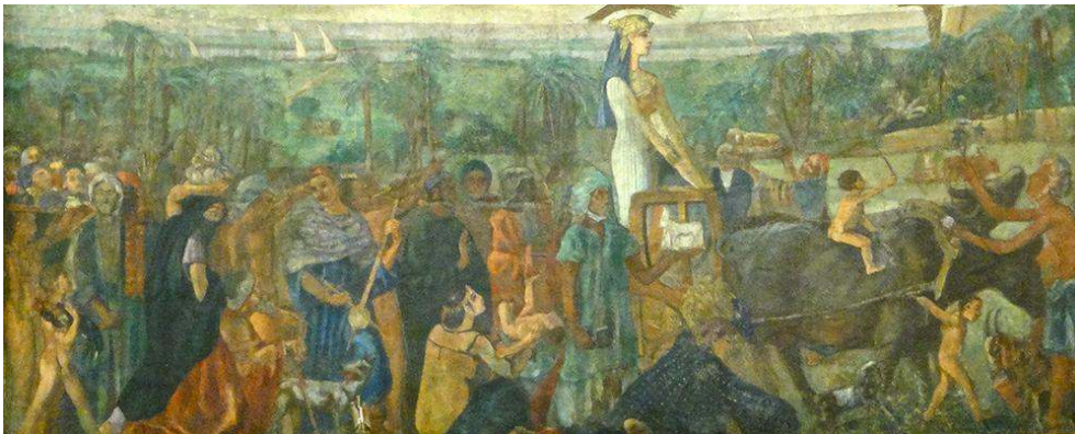
Figure 2: Mohamed Naghi, La Renaissance de l'Égypte ou Le Cortège d'Isis , Chamber of the Maglis al-Shuyukh , Egyptian Parliament, Cairo.