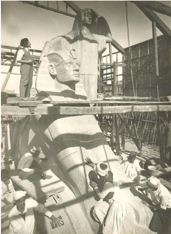
Figure 3: Mahmoud Moukhtar supervising the achievement of Le Réveil de l'Égypte , c. 1928.