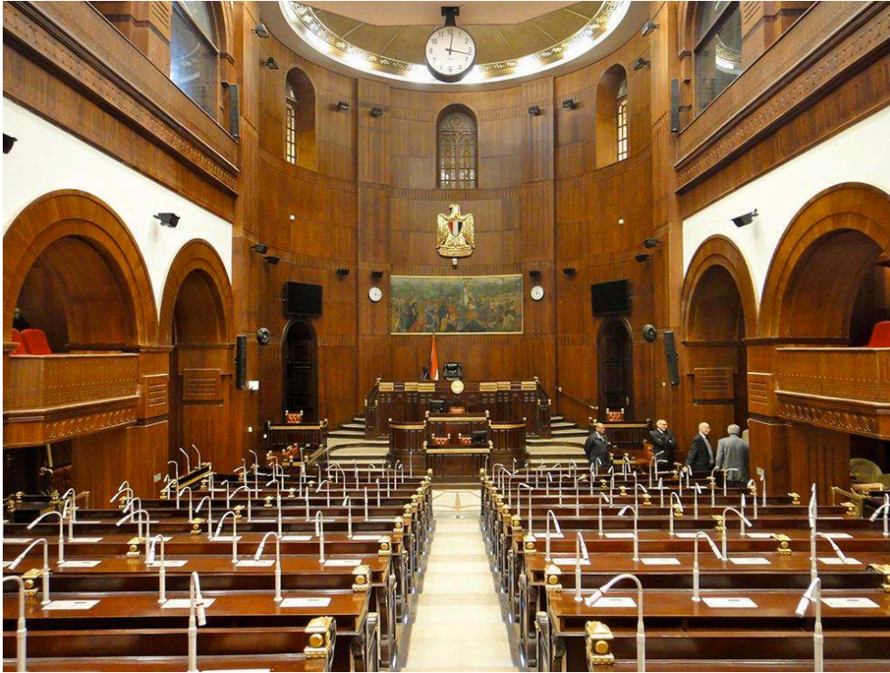
Figure 1: Interior of the Chamber of the Maglis al-Shuyukh , Egyptian Parliament, Cairo, with La Renaissance de l'Égypte ou Le Cortège d'Isis by Mohamed Naghi, 1922.