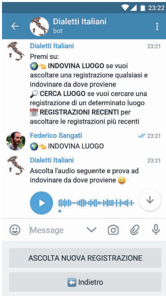
Figure 1: Screenshot of the DialettiBot system.

of the most recent recordings. As an element of gamification (Lafourcade et al., 2015), there is the possibility to ask for a random recording and try to guess its location. The user would then receive a feedback about the distance between the guessed location and the correct one. With this simple game we gather valuable data that would enable us to plot a type of confusability matrix between dialects, i.e., how much a dialect of place A resembles a dialect of place B.