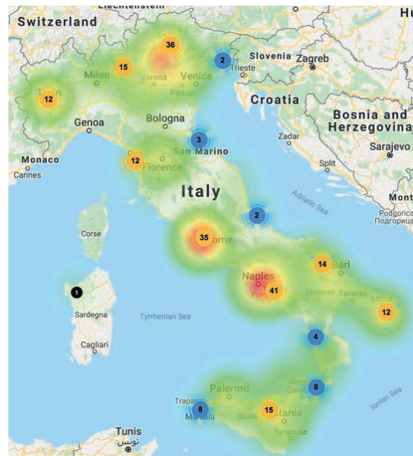
Figure 4: Heat map of the approved recordings. 19