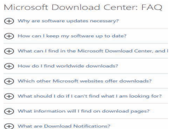
Figure 1: FAQs of Microsoft Download Center

Searching within FAQs can be a tedious task. This becomes even more drawn out when paraphrasing comes into fray. As a result the user is pushed into a maze of questions and answers having to manually look for a particular one as shown in figure 1. It is here that a QA system comes of utmost importance retrieving the particular desired query instantly.