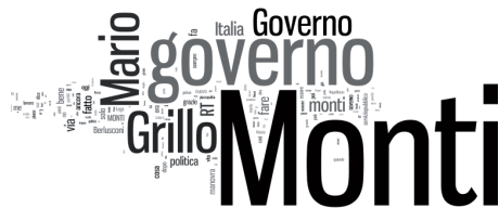
Figure 1: Word cloud from the training data.

Word Embeddings We induced word embeddings from 5 million Italian tweets (TWITA) from Twita (Basile and Nissim, 2013). Vectors were created using word2vec (Mikolov and Dean, 2013) with default parameters, except for the fact that we set the dimensions to 64, to match the vector size of the multilingual (POLY) embeddings (Al-Rfou et al., 2013) used by Plank et al. (2016). We dealt with unknown words by adding a “UNK” token computing the mean vector of three infrequent words (“vip!”, “cuora”, “White”).