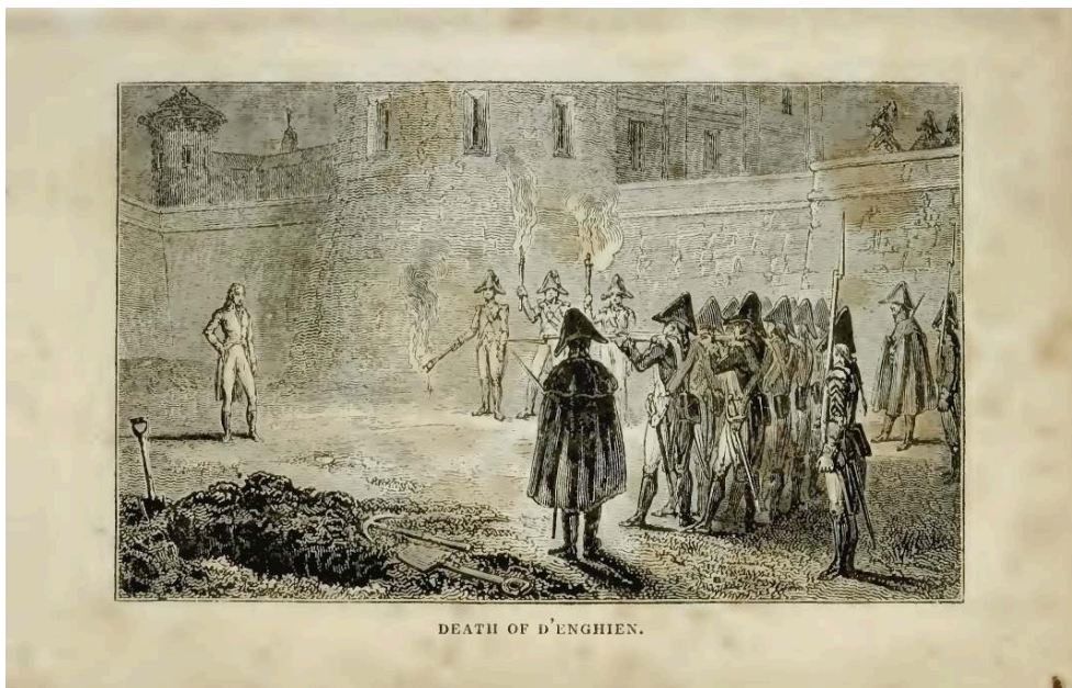
Fig. 5: John Thompson after George Cruikshank, Death of d'Enghien , 1829, steel engraving, in J[ohn] G[ibson] Lockhart, The History of Napoleon Buonaparte , vol. 1, (London: John Murray, "Murray's Family Library," 1830), between pages 288 and 289.