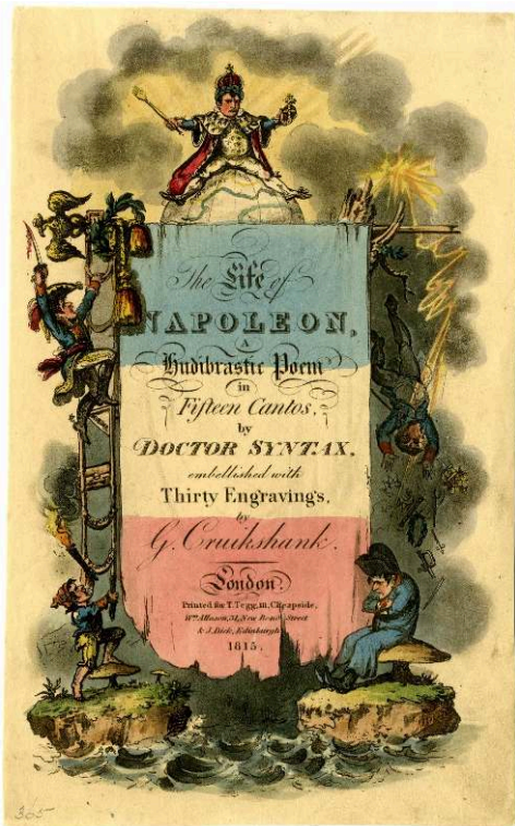
Fig. 6: Frontispiece, George Cruikshank, The Life of Napoleon: A Hudibrastic Poem in Fifteen Cantos, by Doctor Syntax , hand-colored aquatint engraving, 22.1 × 13.6 cm, London, The British Museum.

William Combe's blockbuster collaboration in The Tour of Doctor Syntax in Search of the Picturesque . 37 What is forgotten is that The Life of Napoleon was evidently quite successful; it went into four editions and was reissued in 1817. 38 Tegg had originally released this extended satire serially, before collating it and selling it as a book with additional images a few months later. In November and December of 1814, then, Cruikshank's engravings had begun circulating in the market as single-sheet satires in coloured and uncoloured formats, without the accompanying Hudibrastic poetry. That the images were distributed as stand-alone satires, before Tegg repackaged the series, suggests that visual satire was the chief attraction of the volume. But it also implies the potential for a wider scope of dissemination. Satirical prints of Bonaparte's exploits could have circulated as humorous reflections on the folly of French ambition even after the British withdrew from the Peninsula in April 1814. 39