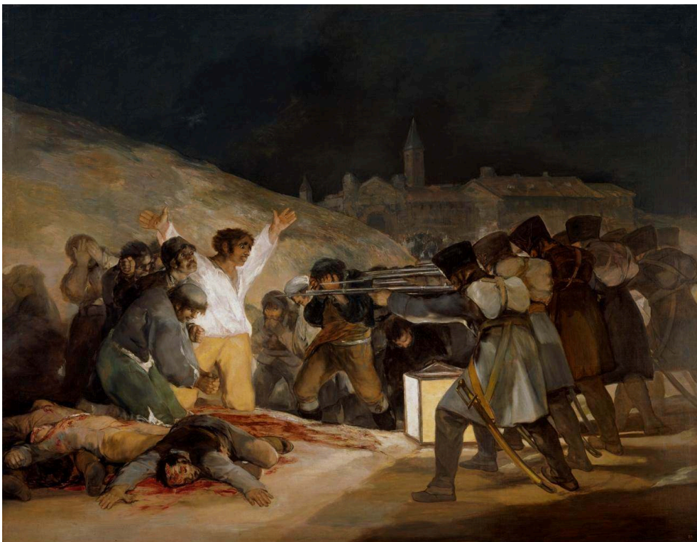
Fig. 2: Francisco de Goya y Lucientes, The 3rd of May 1808 or "The Executions," 1814, oil on canvas, 268 × 347 cm, Madrid, Museo Nacional del Prado.

© Trustees of the British Museum, BM 1865,1111.2294.