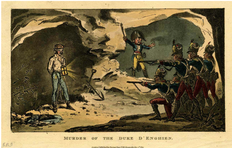
Fig. 1: George Cruikshank, Murder of the Duke d'Enghien , December 7, 1814, hand-colored etching, 13.8 × 21.8 cm, London, The British Museum.

© Trustees of the British Museum, BM 1865,1111.2294.