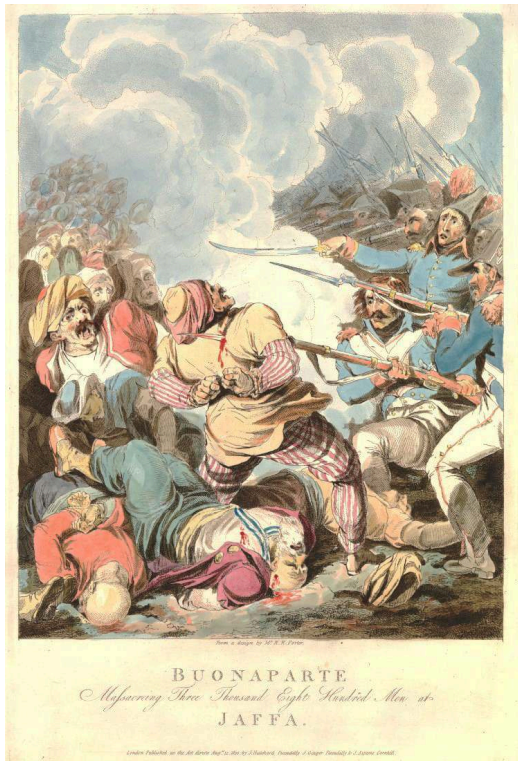
Fig. 3: Sir Robert Ker Porter, Buonaparte massacring three thousand eight hundred men at Jaffa , August 12, 1803, hand-colored etching, 44.6 × 28.4 cm, London, The British Museum.

© Trustees of the British Museum, BM 1866,0407.983.